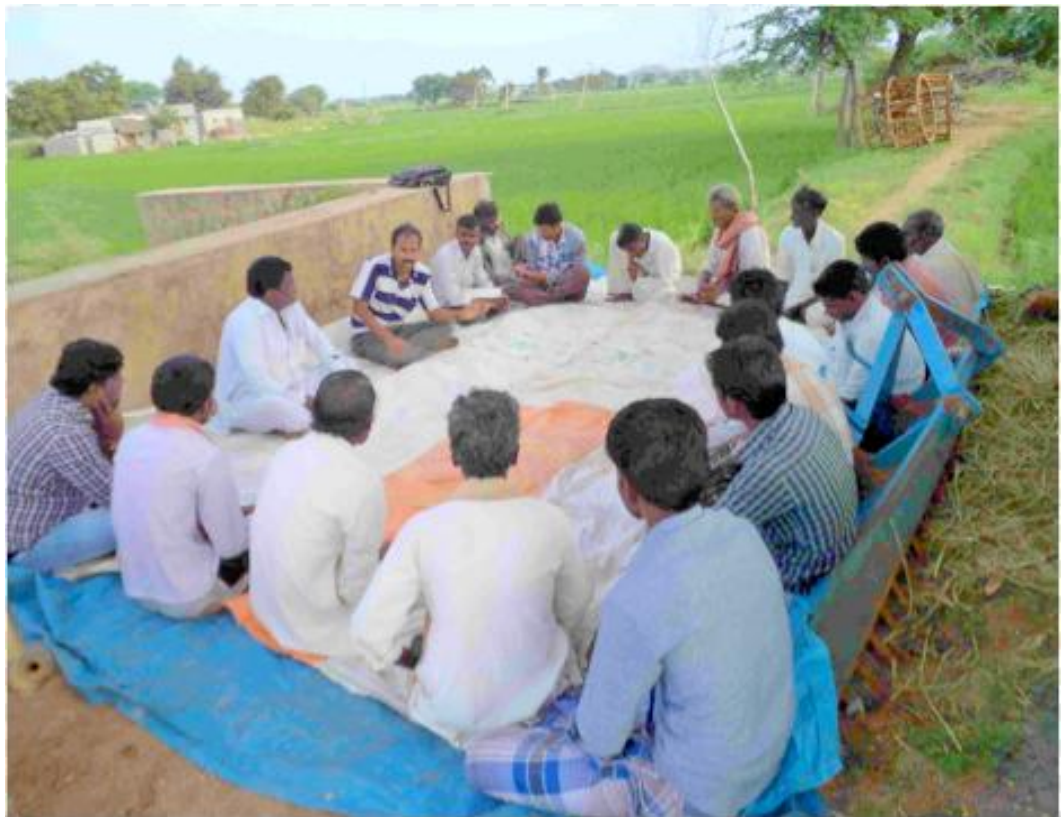
Farmer Field School

An Apex Farmers Group was formed this year and one Representative General Body meeting was held. During this year, 20 Farmers Club were formed with the enrolment of NPM paddy farmers in the programme villages. Of these, 14 clubs have been approved by NABARD so far.