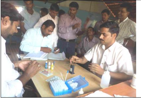
Blood camp in Yaradona in Gangavathi Taluk

Samuha set up a district level helpline on 9 th Jan 2013 as a step towards implementing Mission 12-18 in the district, and to make blood available for needy pregnant women and children. The 24-Hour Samuha Sahayawani allows people to seek assistance on any issue relating to maternal and child health in general, and particularly related to blood.. While the helpline serves as a catalyst connecting help seekers to appropriate relief agencies, it also serves as a means of connecting blood seekers and donors / appropriate agencies in emergencies. It has also conducted 6 blood donation awareness events known as “ Raktha Daanakkagi Naavu mattu Neevu (You and us for blood donation), and blood group testing camps.