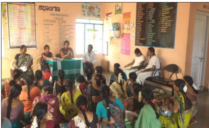
Convergence Meeting Gunnal PHC staff, ICDS and ASHA workers

The action research project at Gunnal PHC, that covers around 20,000 population across 10 villages, is aimed at gaining a better understanding on the process of Inter-departmental convergence . Started in June 2010, the process focuses on bringing convergence among five partners on a shared vision. The five stake-holders are