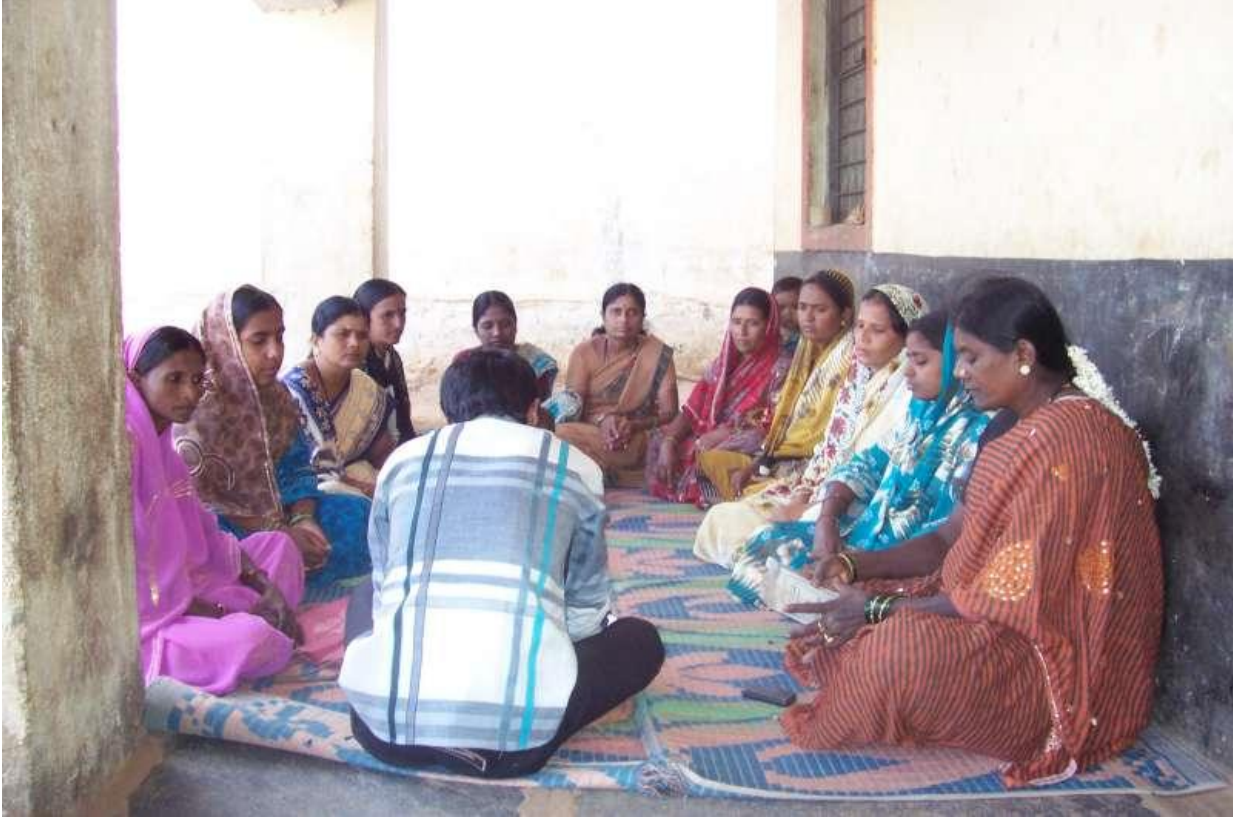
Karthik Munjawu Mahila Gumpu, Kanakagiri

JanaraHana: JanaraHana, people's money, is the rural micro credit resource group of SAMUHA. JanaraHana assists women members of thrift self-help groups to access credit from banks.